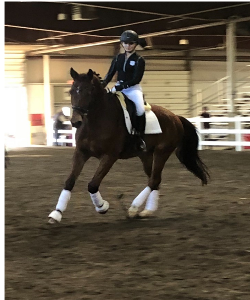
Something for the versatility clinic ??